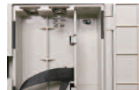
lock/unlock switch inside battery compartment