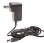
Detachable power adapter