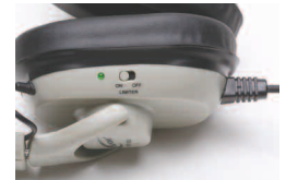
85dB switch built into earcup