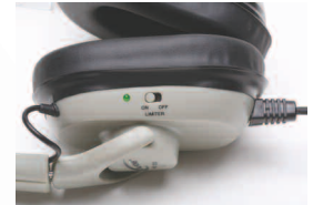
85dB switch built into earcup

Guaranteed for Life™ headset cord cross-section