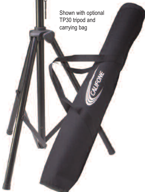
Shown with optional TP30 tripod and carrying bag