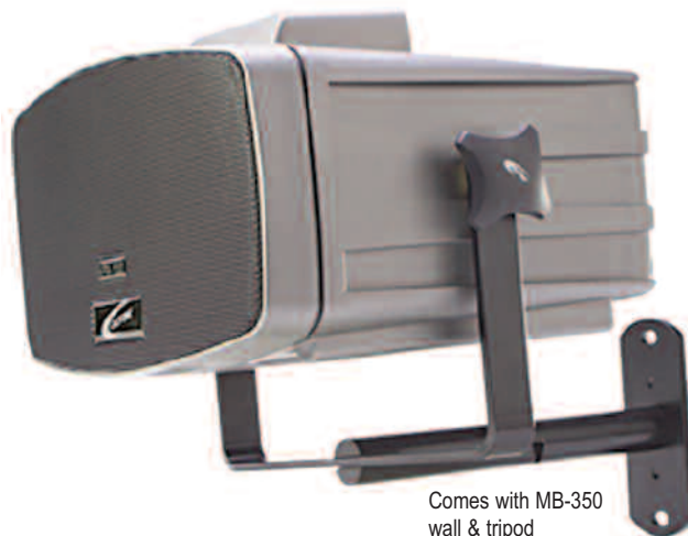
Comes with MB-350 wall & tripod mounting bracket

It can be used in classrooms, labs, cafeterias, auditoriums, meeting rooms, hotel & conference rooms, and even outdoor events.